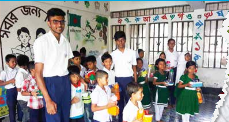
Visiting the "Hope for destitute women" daycare centre

Our senior students and teachers regularly volunteer to teach at a government primary school in Bosilla, where they conduct classes for children from poorer socio-economic backgrounds.