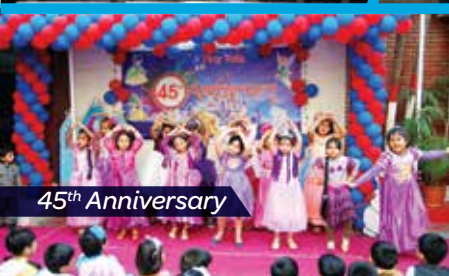
45 th Anniversary